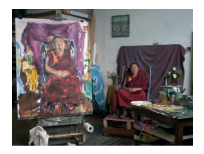
Studio photograph: Co Sligo, 2006. Rinpoche sitting.