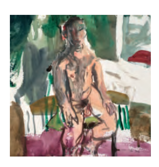
14. Derval sitting, 2006 watercolour, 30 x 30 cm