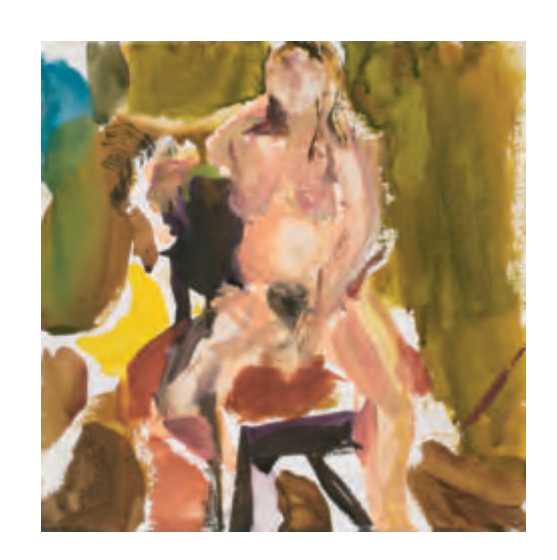
13. Gemma sitting I, 2006 watercolour 30 x 30 cm