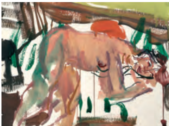
12. Patricia lying III , 2005 watercolour, 22.5 x 30 cm