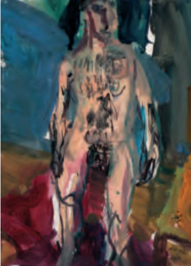
6. Derval standing III , 2006 watercolour , 26 x 18 cm