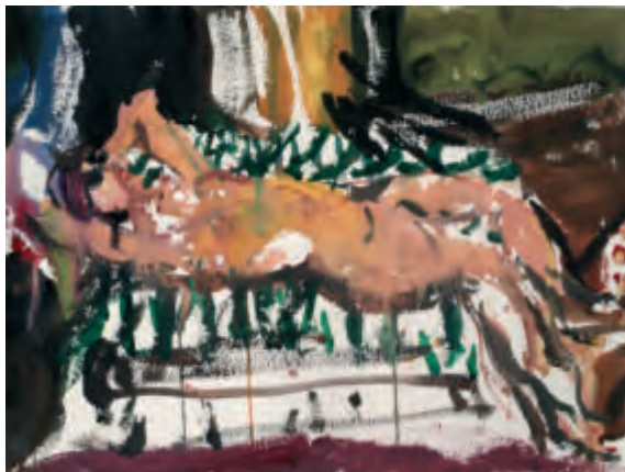
11. Patricia lying I , 2005 watercolour, 31 x 40 cm