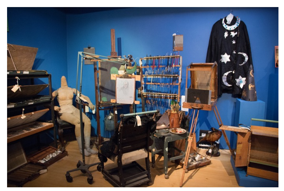
Room 4: Archive Material. Collection Irish Museum of Modern Art. Donated by Sally McGuire 1997.