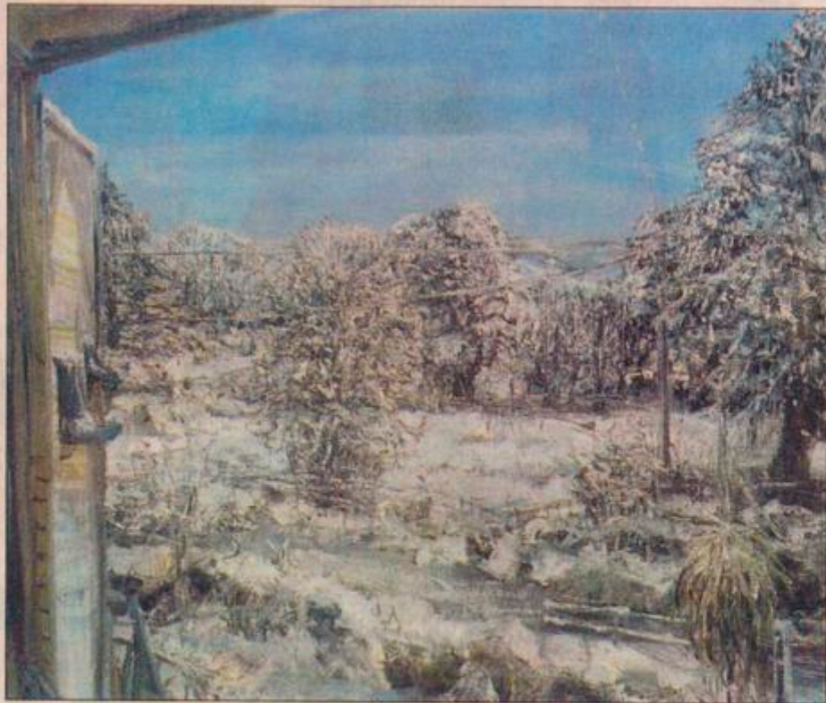
Snowscape, Whitethorn (2001). Although Miller relishes lush growth, his preferred seasons are winter and spring

'In many of the pictures we can see the arch of the open back of the truck. One painting foregrounds the interior of the truck itself'